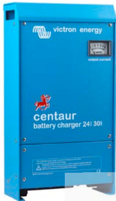
Centaur Battery Charger 24/30