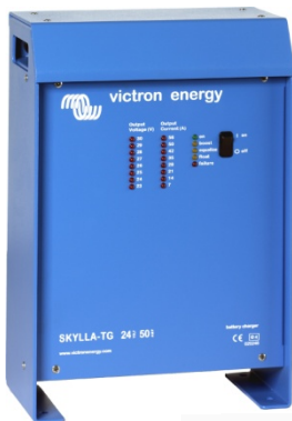
Skylla Charger 24 V 50 A