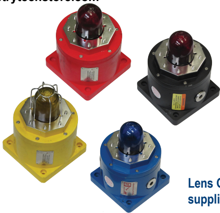
Lens Guard not supplied as standard