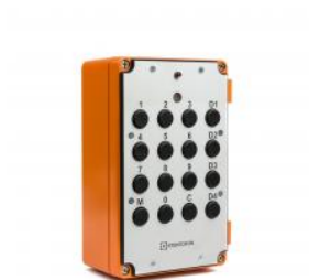
Industrial Master Station