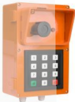
Industrial Master Station