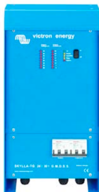
Skylla TG 24/30 GMDSS