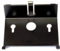
Wall Bracket for Desktop