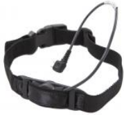
AK6070T Throat microphone for all A-kabel type Headsets