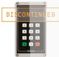
Light Industrial Master Station