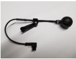
Spare Boom Microphone for Headset

Spare Boom Microphone for all A-Kabel type Headsets