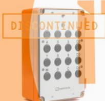
Industrial Master Station