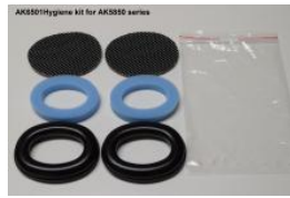
Hygiene kit for Headset

Spare Boom Microphone for all A-Kabel type Headsets